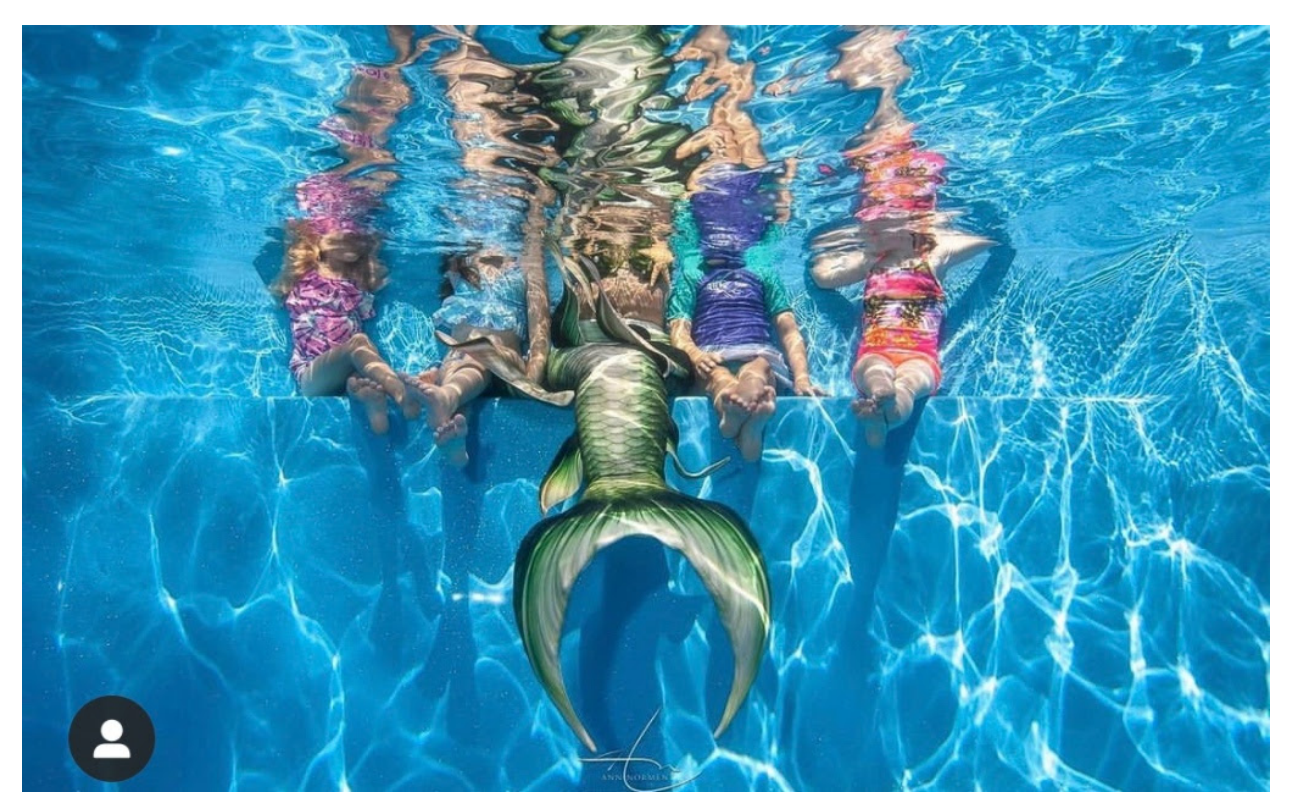
THIS ONE'S FOR THE GUPPIES! FUN! Family Friendly Edu-tainment for the DC Metro like you've NEVER SEEN

For our most up to date policies relating to health and safety, please visit www.mermagic-con.com