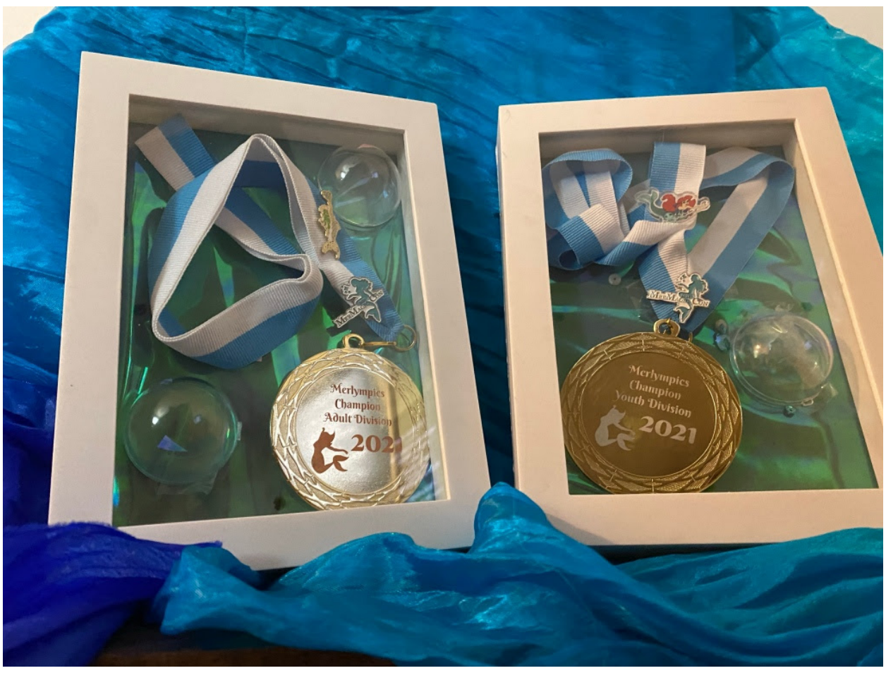
Awards for future mermaid champions wait snugly in display cases.

Children can explore lifeguard-supervised "swim like a mermaid" classes, with tails provided, all-ages crafting workshops, and story time mermaid encounters set around a huge shell throne. Meet and greets feature diverse mermaids of various ages and cultural backgrounds—after all, mermaiding is for everyone!